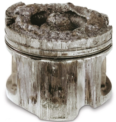
Damage Caused by a Particle

New technologies require cleaner systems. Electrical systems, batteries, and sensors do not tolerate metallic particles. For this reason, production and assembly line planners must pay close attention to the VDA19.2:2010 guideline.