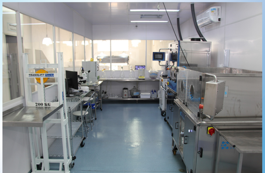
Particle Extraction Laboratory with Cleanroom – Enge Solutions