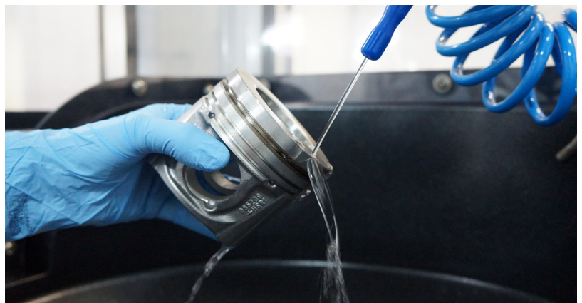
Particle Extraction with Extraction Cabin

Enge Solutions Microscopy Laboratory Particle extraction with extraction