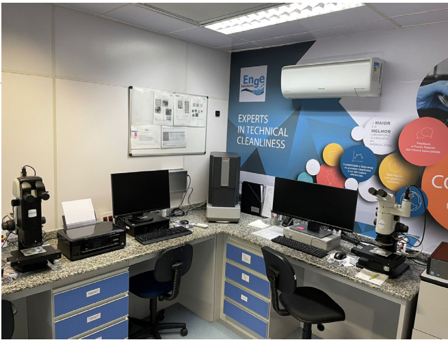
Enge Solutions Microscopy Laboratory

There are countless details within the analysis process that may lead to inaccurate results. A single error can trigger a cascade of issues throughout the production environment, affecting suppliers and end customers.