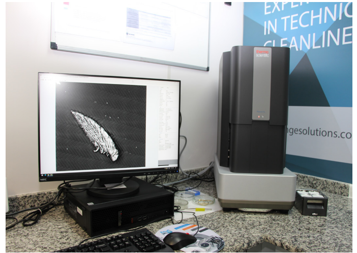
SEM/EDS – Enge Solutions