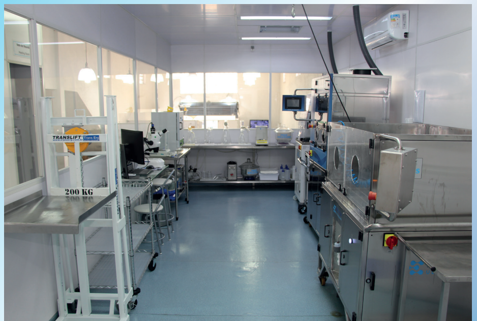
Enge Solutions Particle Extraction Laboratory with Cleanroom